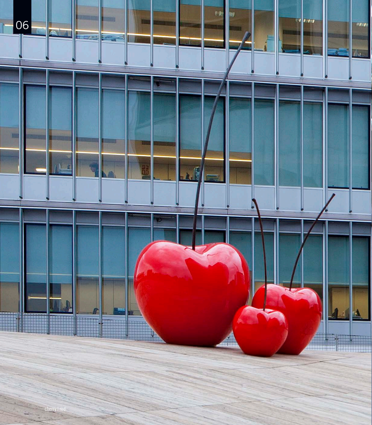
cherry | red