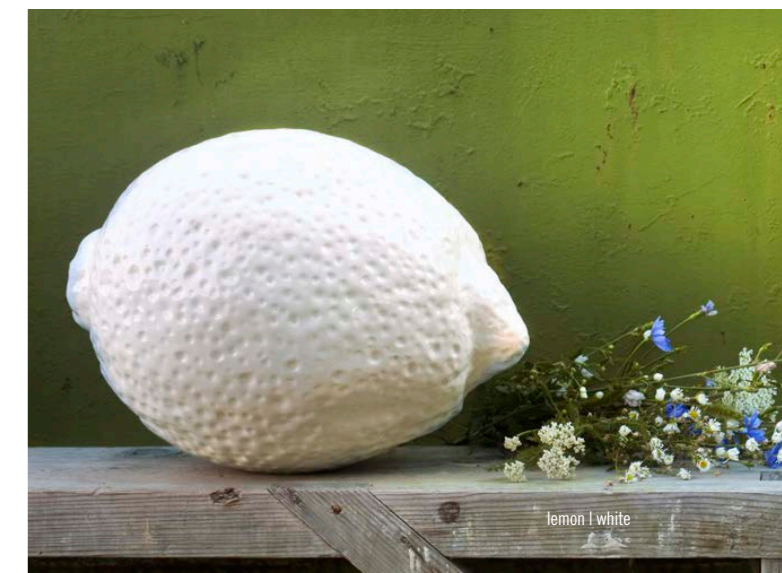
lemon | white