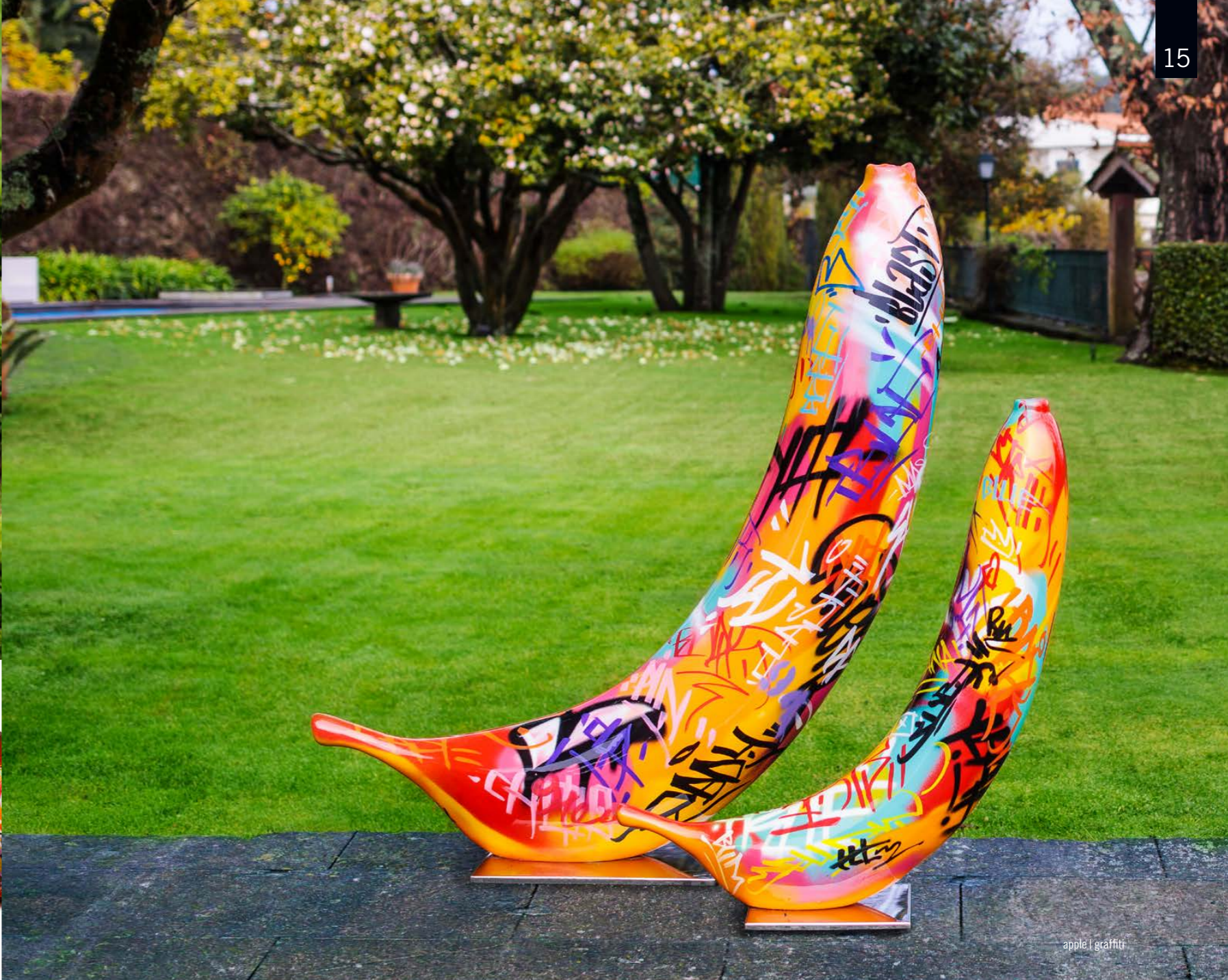
apple | graffiti