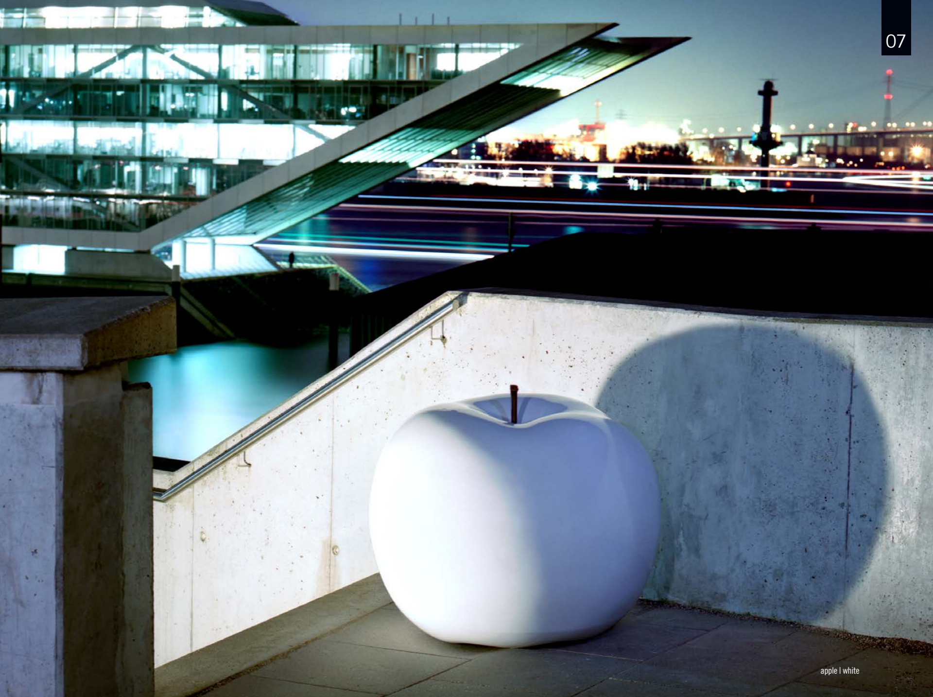
apple | white