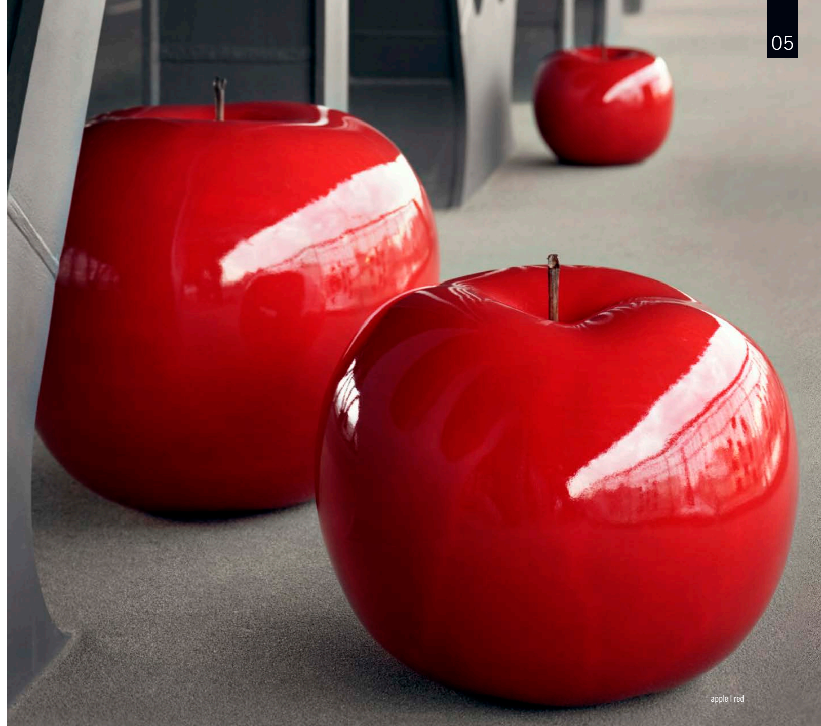
apple | red