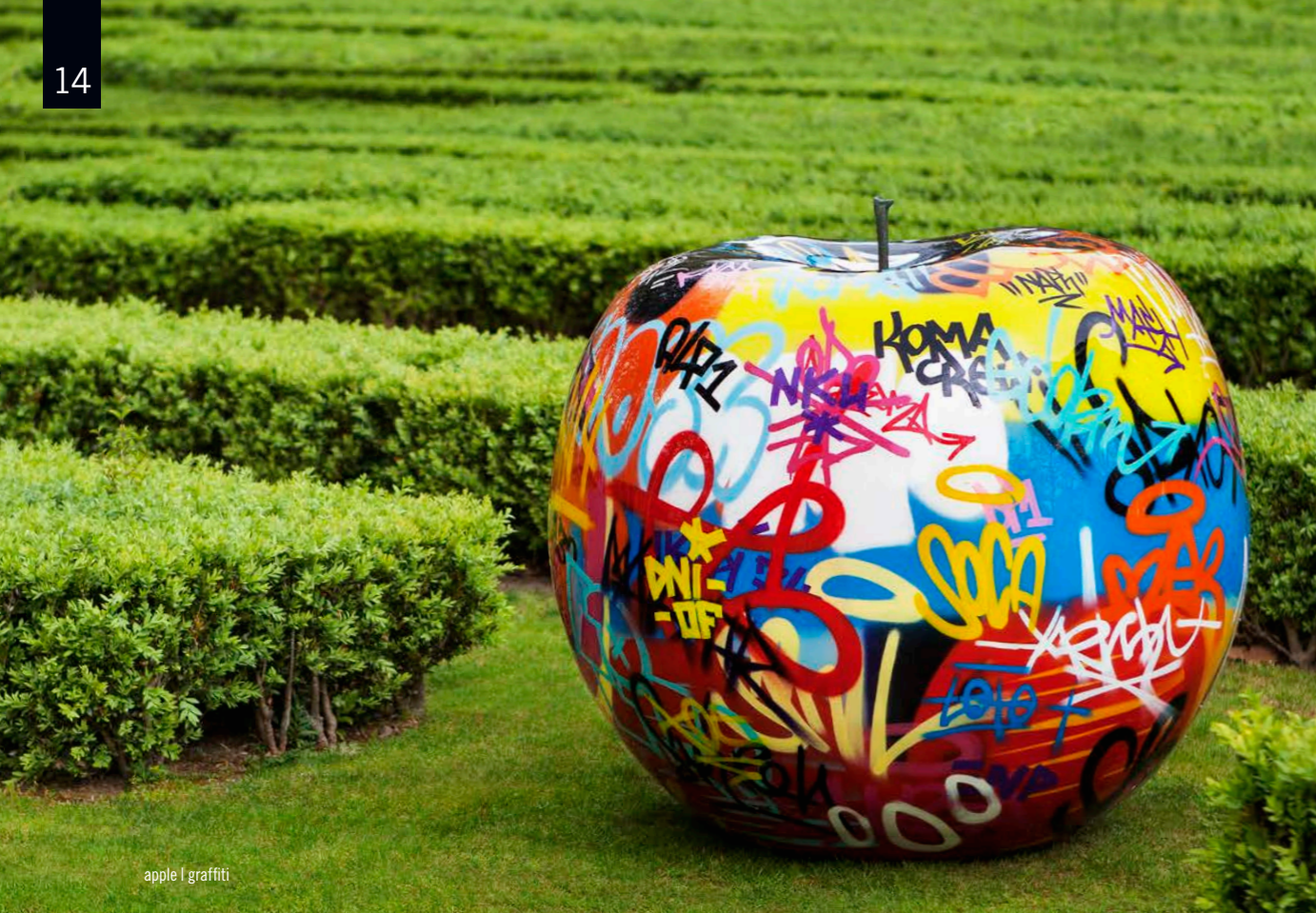
apple | graffiti