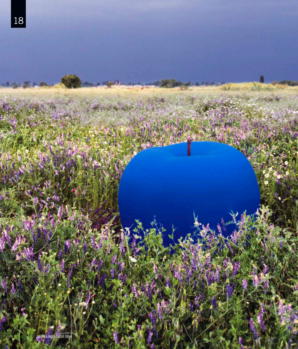
apple | lapis lazuli blue