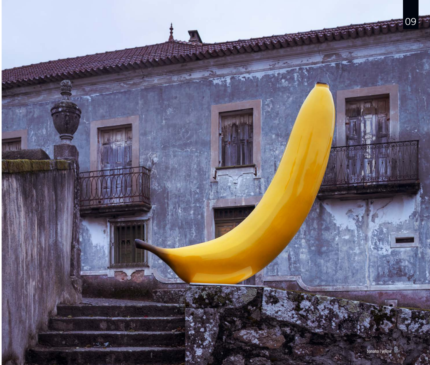
banana | yellow