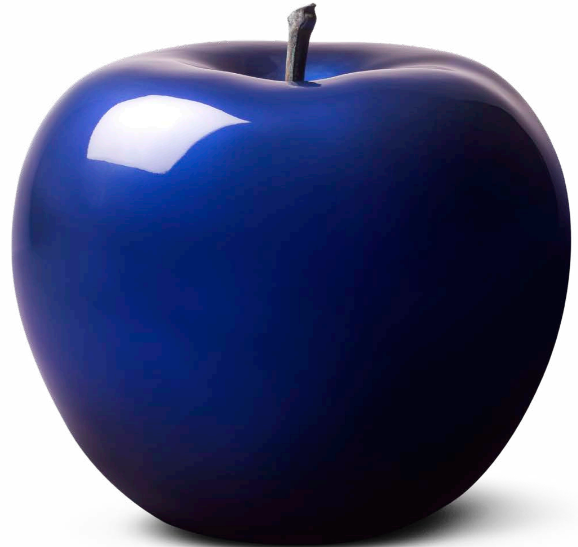
apple | blue metallic