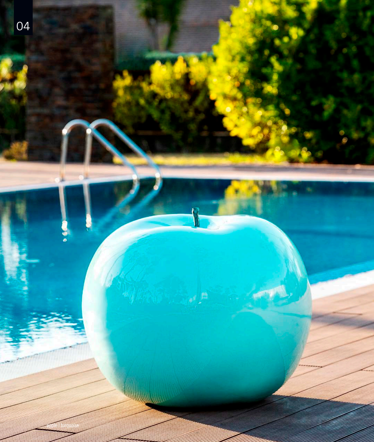
apple | turquoise