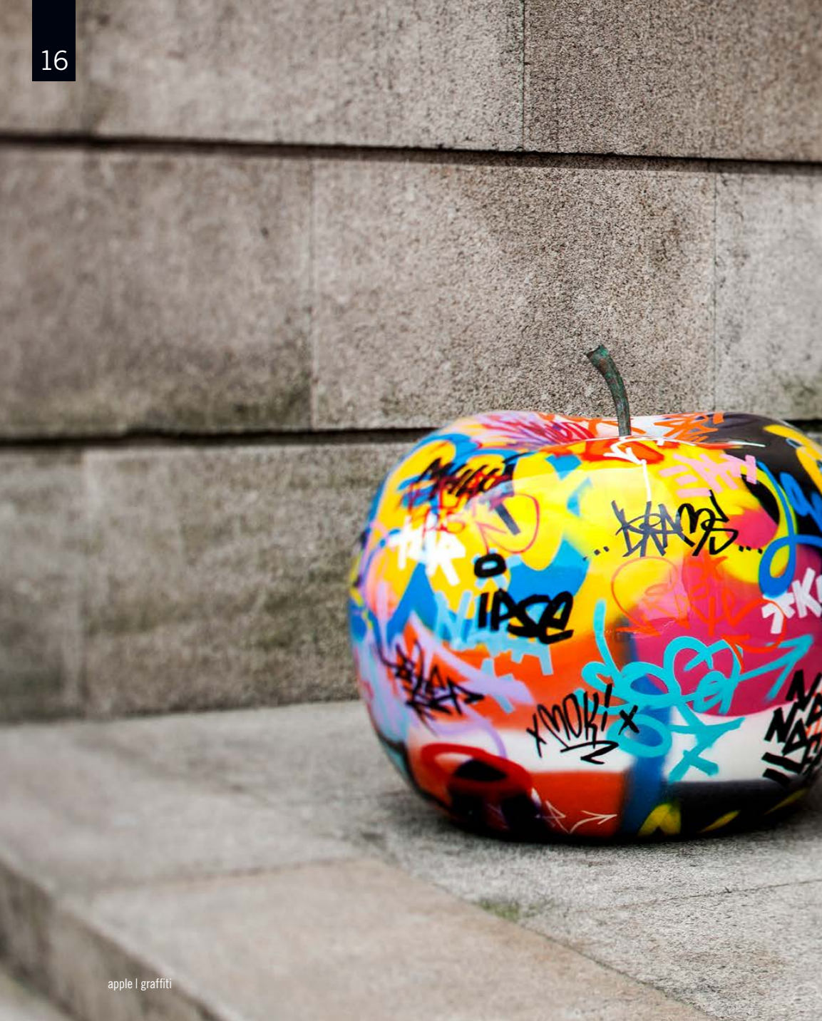
apple | graffiti