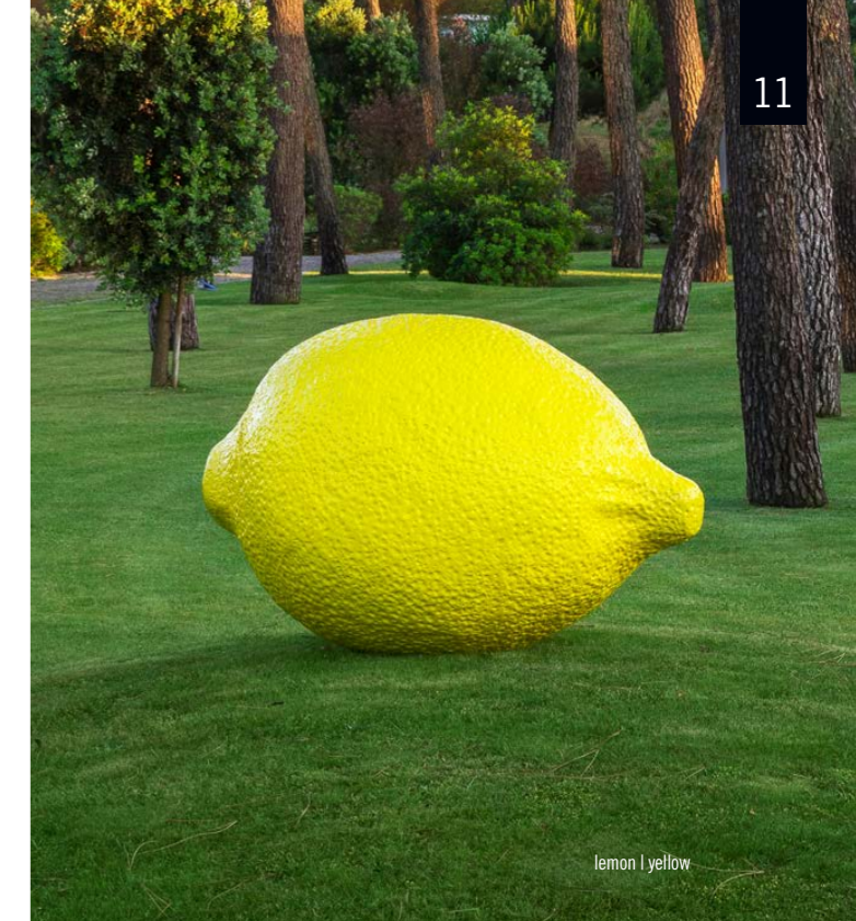
lemon | yellow