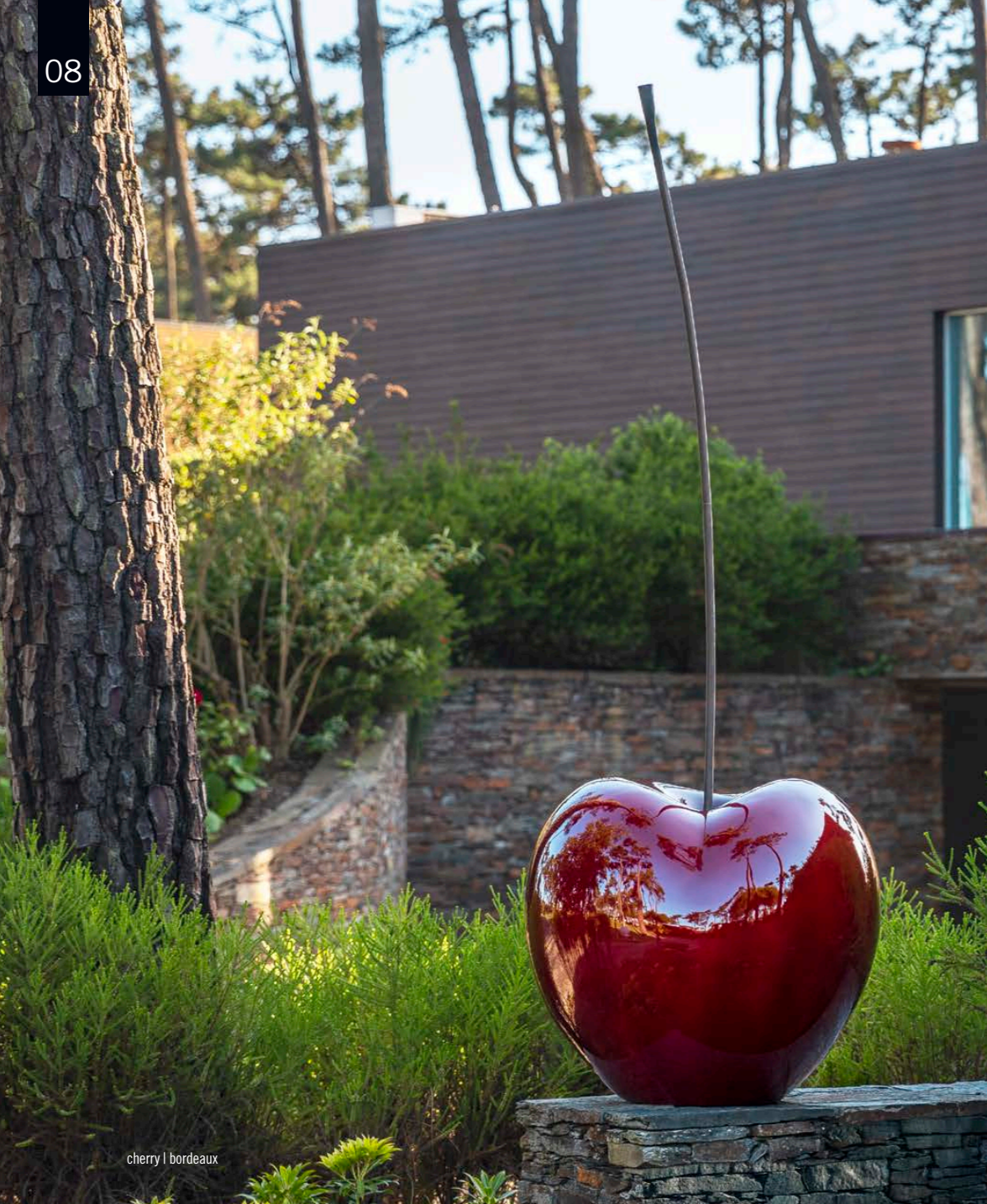
cherry | bordeaux