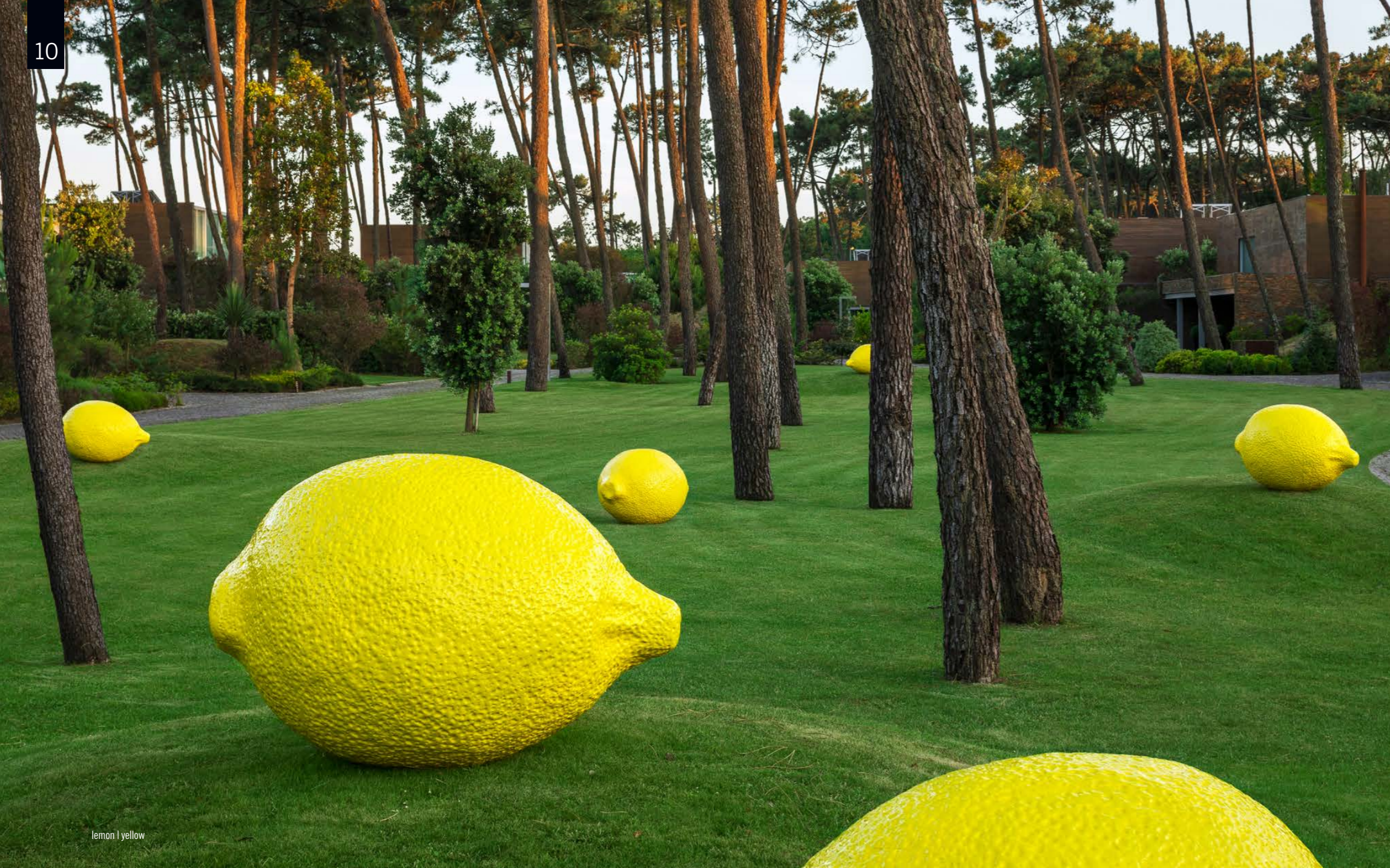
lemon | yellow